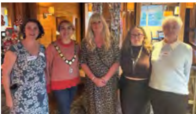
Photo: Mayor of Marlow at The Britannia Macmillan Coffee Morning

The General Manager of The Britannia invited me to their Macmillan Coffee Morning and while there, I learned about their wonderful community initiative: a community coffee afternoon from 4pm – 6pm on the second Monday of every month, providing a free hot drink, a slice of cake or a biscuit, and, more importantly, some friendly chat. I am told these afternoons are very well attended by our seniors, and I am delighted to see such care for community wellbeing.