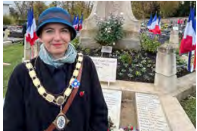
Photo: The Mayor at the Amistice event in Marly Le Roi

October brought with it the Council's first Community Forum. We were thrilled to welcome over 60 attendees from local community groups, organisations, and non-profits. You told us about your struggle to recruit volunteers and the need for a community organisation venue in our town. We are planning our next event for Springtime, following positive feedback. I also had the pleasure of supporting Brighter Futures Together at their Halloween film screening. It was wonderful to see so many families