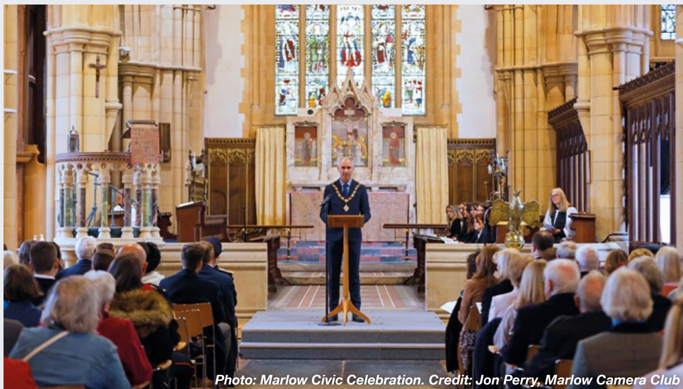
Photo: Marlow Civic Celebration.

As Mayor, I have witnessed first-hand the incredible generosity and kindness that define our town. From volunteers giving their time to help those in need, or keeping our town clear of litter, to businesses supporting local initiatives, to neighbours looking out for one another, the spirit of unity that thrives here is truly remarkable.