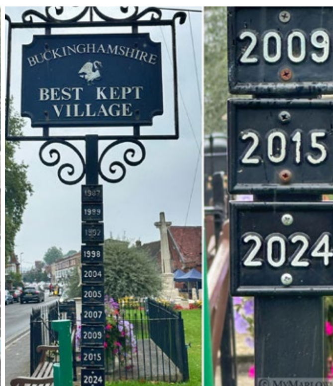
Photo: (left) Bunting, (right) Best Kept Village Picture