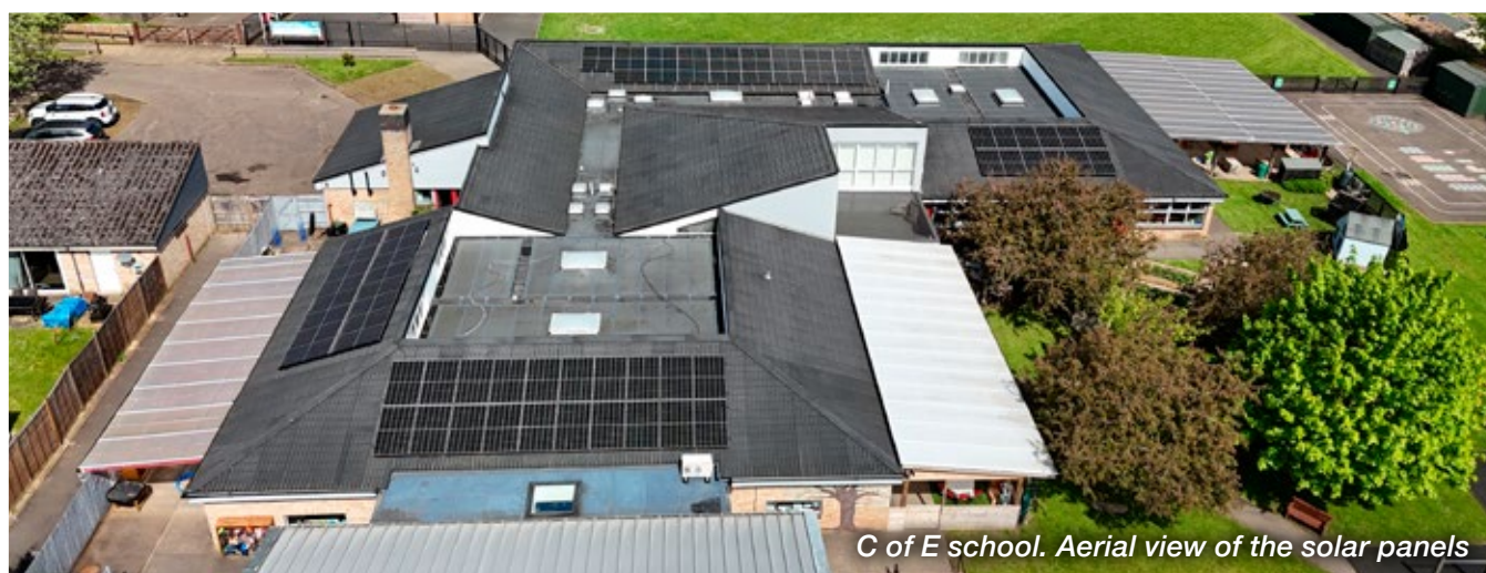
C of E school. Aerial view of the solar panels

We would like to thank the Oxford Diocese Board of Education, Buckinghamshire Community Board and Marlow Environment Trust along with the school's Parent & Friends Association for their support and funding which has allowed us to carry out and continue this vital work.