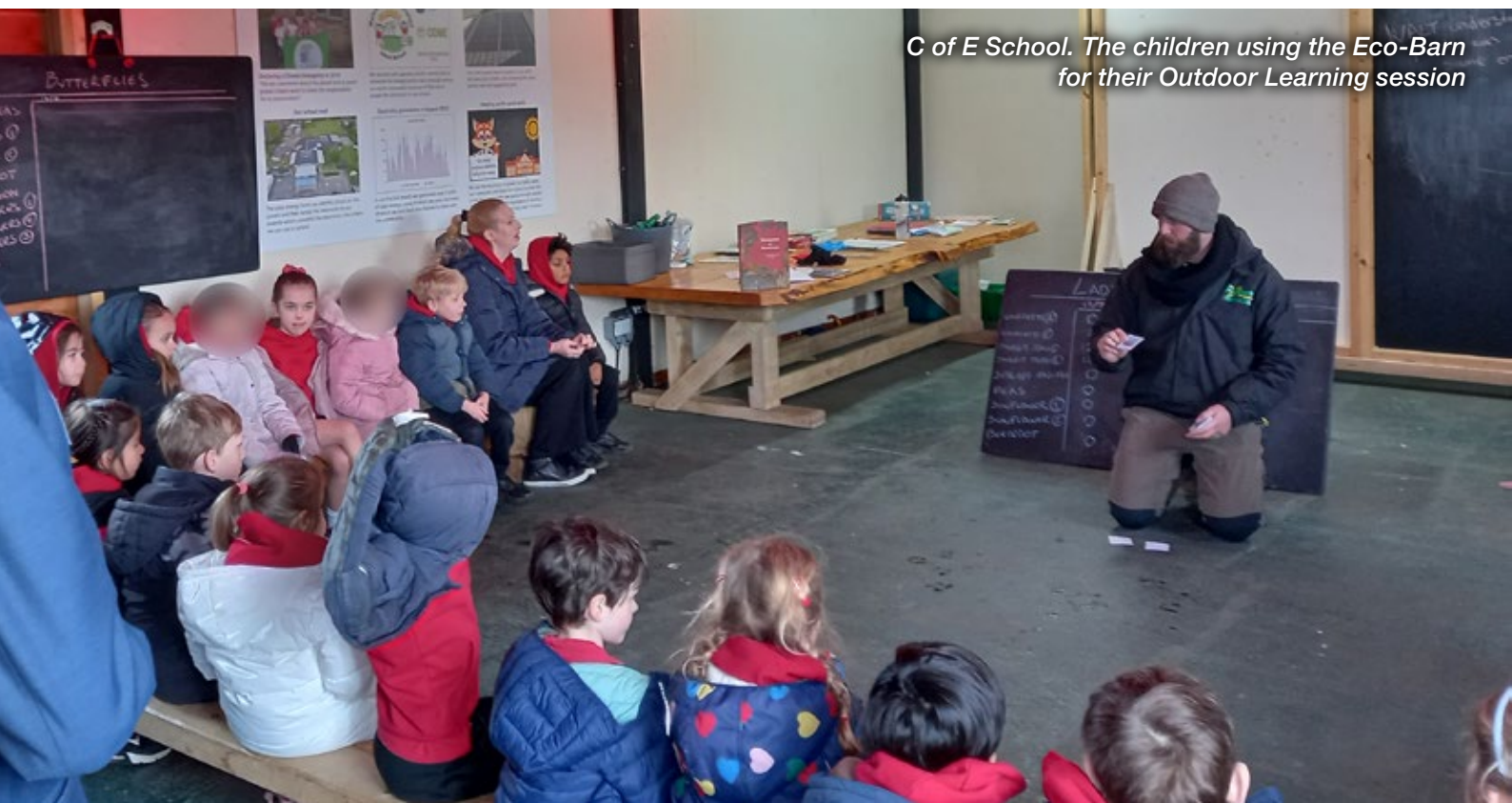
C of E School. The children using the Eco-Barn for their Outdoor Learning session