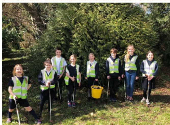
Photos: (above) Danesfield; (below left to right) Foxes Piece; (opposite, top left to right) Marlow C of E Infants; (opposite, bottom left to right) St Peter's