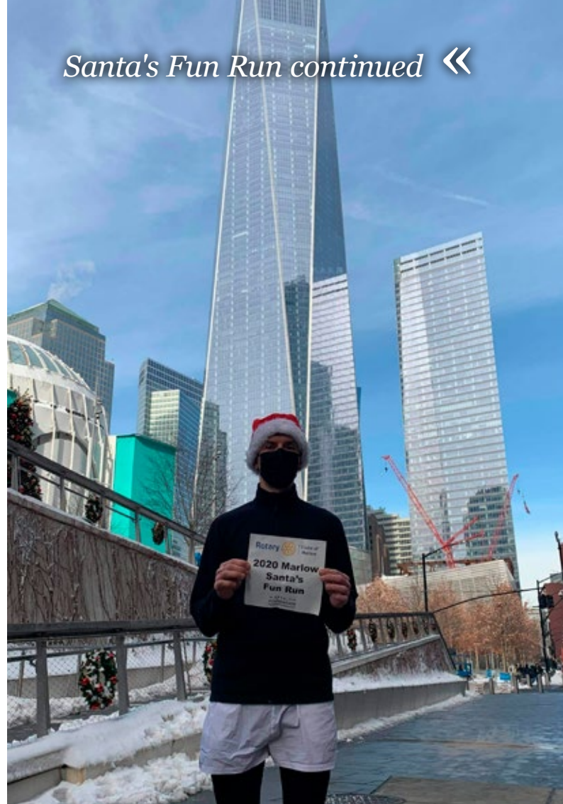
Santa's Fun Run continued <<