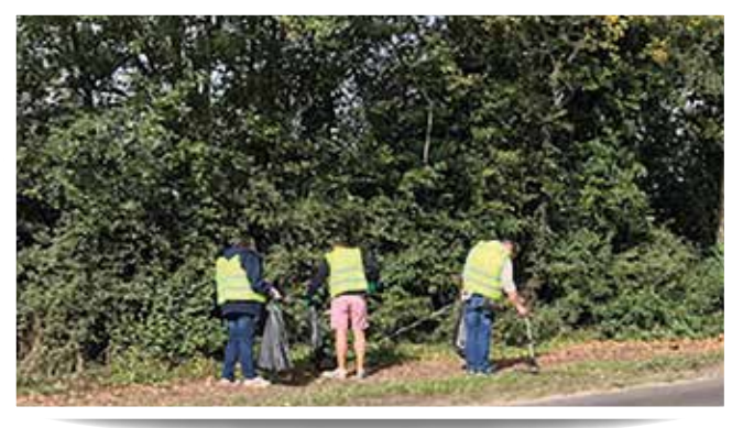
Softcat volunteers litter-picking