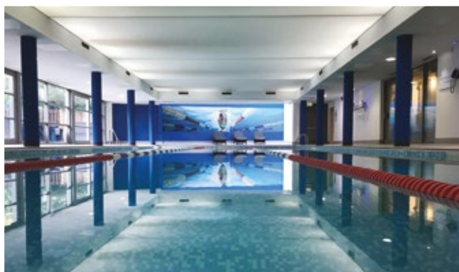
A three-month off peak membership at the Marlow Club