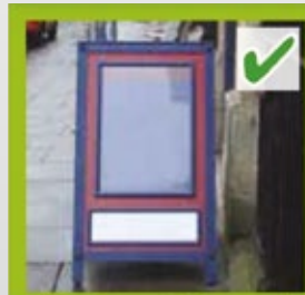
Single sign against property