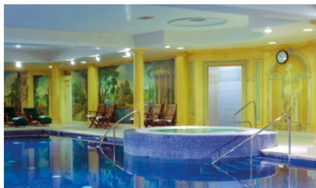
A spa experience day with manicure for two at Danesfield House