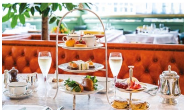
A Champagne afternoon tea for two at The Ivy Garden, Marlow