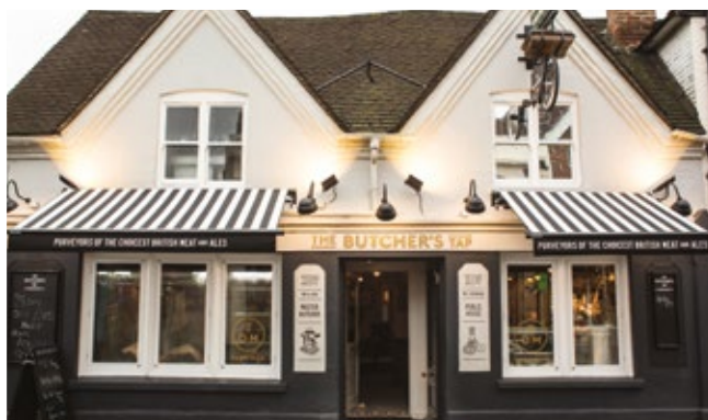
A hamper of the freshest produce from The Butcher's Tap, Marlow