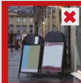
More than one per property